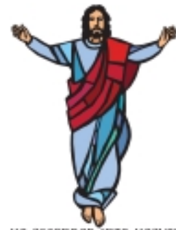
HE ASCENDED INTO HEAVEN

... Oh, wrong question. The right one is this: Why did Jesus have to leave?